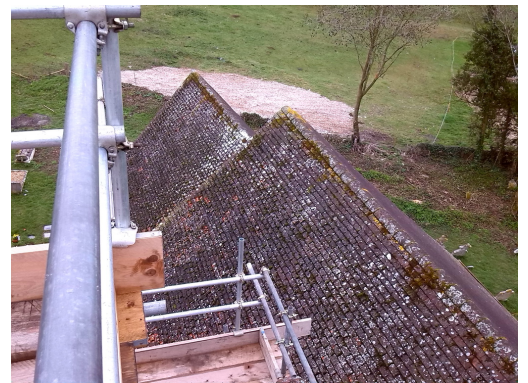
Roof looking east

Applications for funding will be made to organisations, online and media campaigns will be arranged and there will be specific fund-raising activities including the Raise the Roof Concert that will be held at Clapham church on 6 th September.