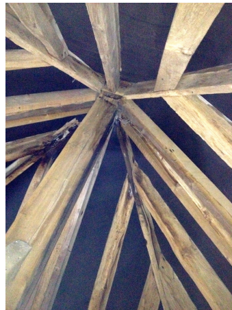
Apex - Feb. 2014

Applications for funding will be made to organisations, online and media campaigns will be arranged and there will be specific fund-raising activities including the Raise the Roof Concert that will be held at Clapham church on 6 th September.