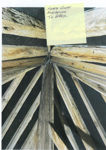
Apex - recent