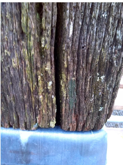
Finial crack allowing water ingress behind lead flashing