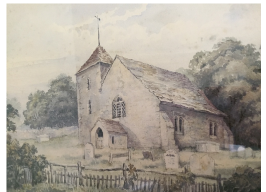
Spot the changes from then to now